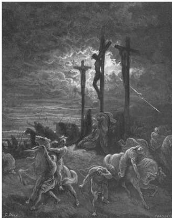
The Darkness at the Crucifixion

"It was now about noon, and darkness came over the whole land until three in the afternoon, for the sun stopped shining."