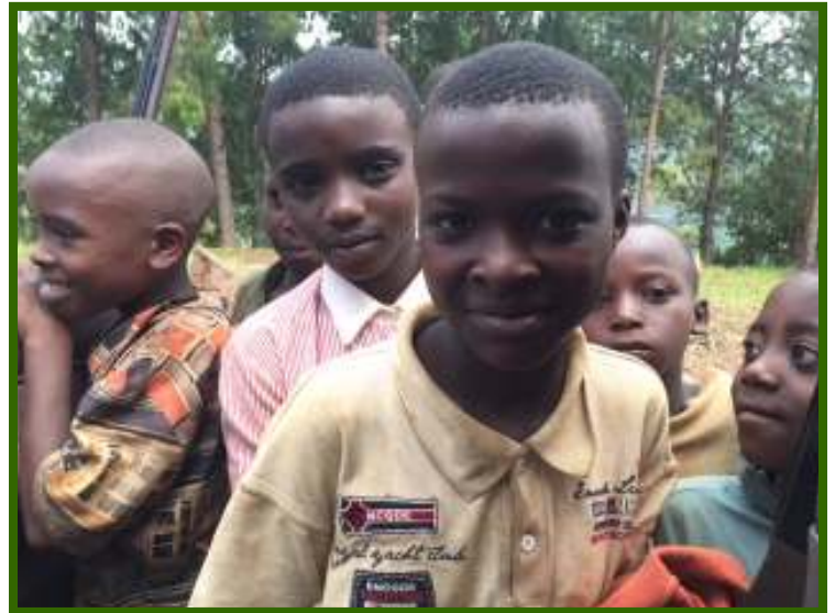
(See photos throughout this publication. Article continues on back page.)

people with a right to be angry, it would be Rwandans. Here in the aftermath of vile and evilness, Rwanda has risen to relational heights that the rest of the world only dreams of attaining.