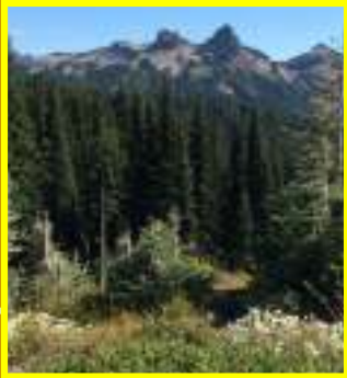
Jesus is Lord