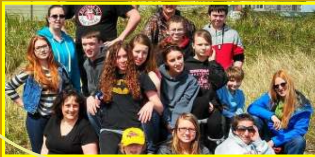
Jesus is Lived