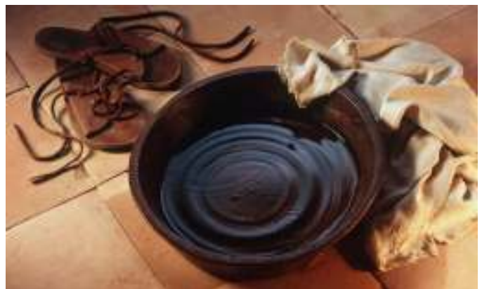
WISDOM FROM OSWALD CHAMBERS

We have to go the "second mile" with God (see Matthew 5:41 ). Yet some of us become worn out in the first ten steps. Then we say, "Well, I'll just wait until I get closer to the next big crisis in my life." But if we do not steadily minister in everyday opportunities, we will do nothing when the crisis comes.