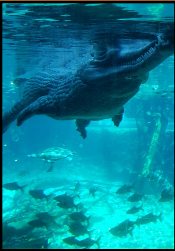
Above: If I remember my animals correctly, this is a Gharial. It's a species of crocodile that is distinguished by its thin snout. This guy just floated around the tank with a couple of fish and some chill turtles. I called him Steve, he seemed like a Steve.

We took a trip to the Fort Worth Zoo with the previous team, just getting out and getting fresh air. To simply get out and smell fresh air was a great blessing. We were all excited to see the different animals and even gave some of them names. They had placed bronze statues of different animals around at random points. They had a Tortoise, a Komodo Dragon, and a mini Kangaroo. Of course, I took a picture of me riding all of them! And to match the occasion I wore my cheetah print bandanna as a mask. We wanted to beat the heat and the crowds so we arrived early in the morning when it first opened but even then it was pretty hot for me (I'm still getting used to it). But even getting there early we couldn't see the whole place before we left for lunch. I think that my favorite place was the bird cage, we could walk in and hang out with the parakeets and Parrots. They even sold popsicle sticks with bird seed on them to attract the little guys to you! I got one and spent my time with the stick in my mouth hoping they would hop on it for a cool picture... no takers. But they did eat off of it.